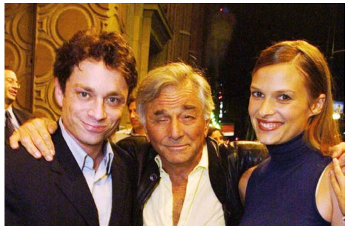
(left) Television personalities Mr. T of A-Team, left, and Peter Falk; (right) Filmmakers and the stars of Touchstone Pictures' "Corky Romano" reunite for the cast and crew screening at the El Capitan Theatre in Hollywood on Monday, October 8, 2007