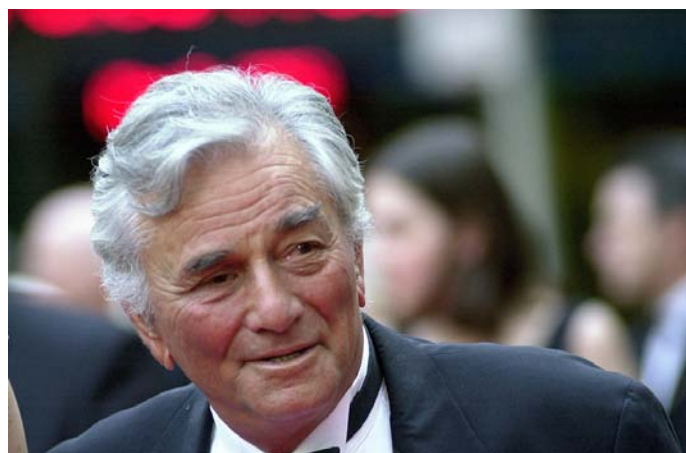
Peter Falk works on a charcoal drawing at his home studio in Beverly Hills; (right) Falk at NBC's 75th anniversary celebration at New York's Rockefeller Center in 2002