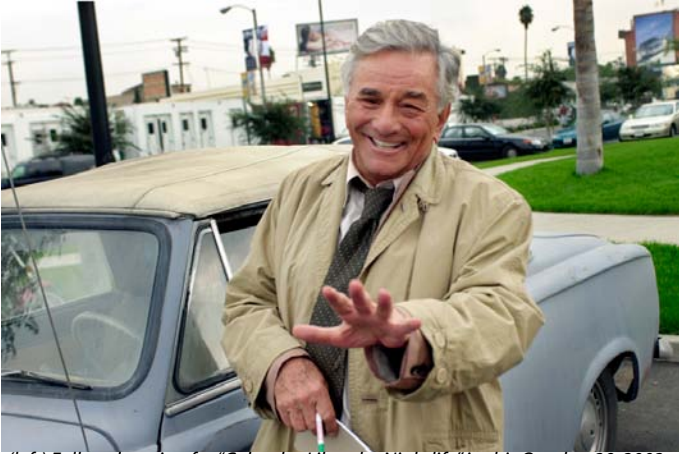
(left) Falk on location for "Columbo Likes the Nightlife" in this October 29, 2002 photo; (right) at the 27th International Film Festival in Cannes, France, on May 18, 1974